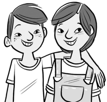
Liam — 14 years old